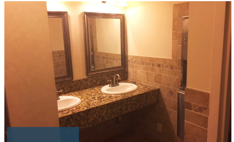
1st Floor Restroom