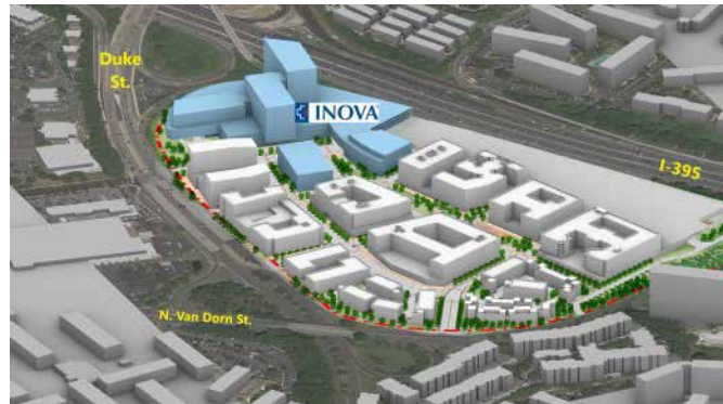
(Concept drawing, subject to change)