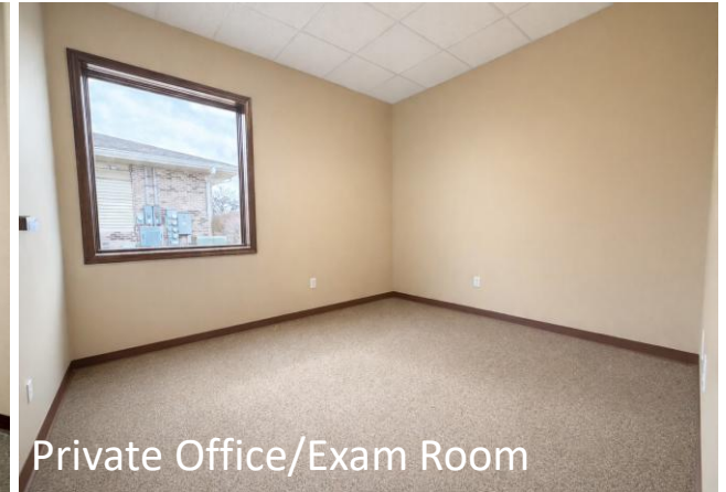
Private Office/Exam Room