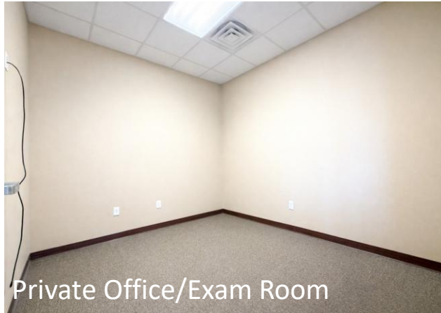
Private Office/Exam Room