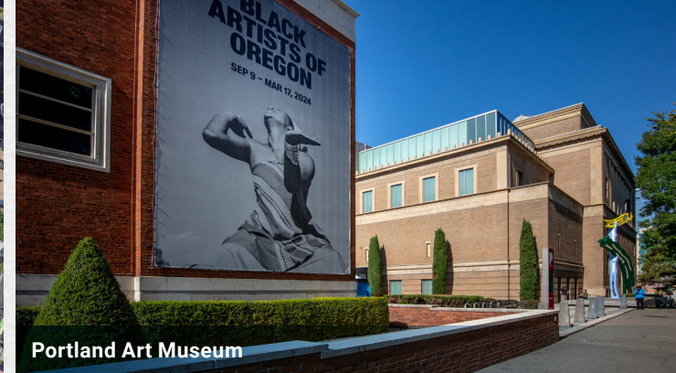
Portland Art Museum