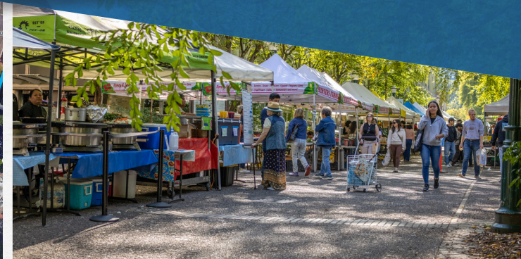
Park Blocks Farmer's Market