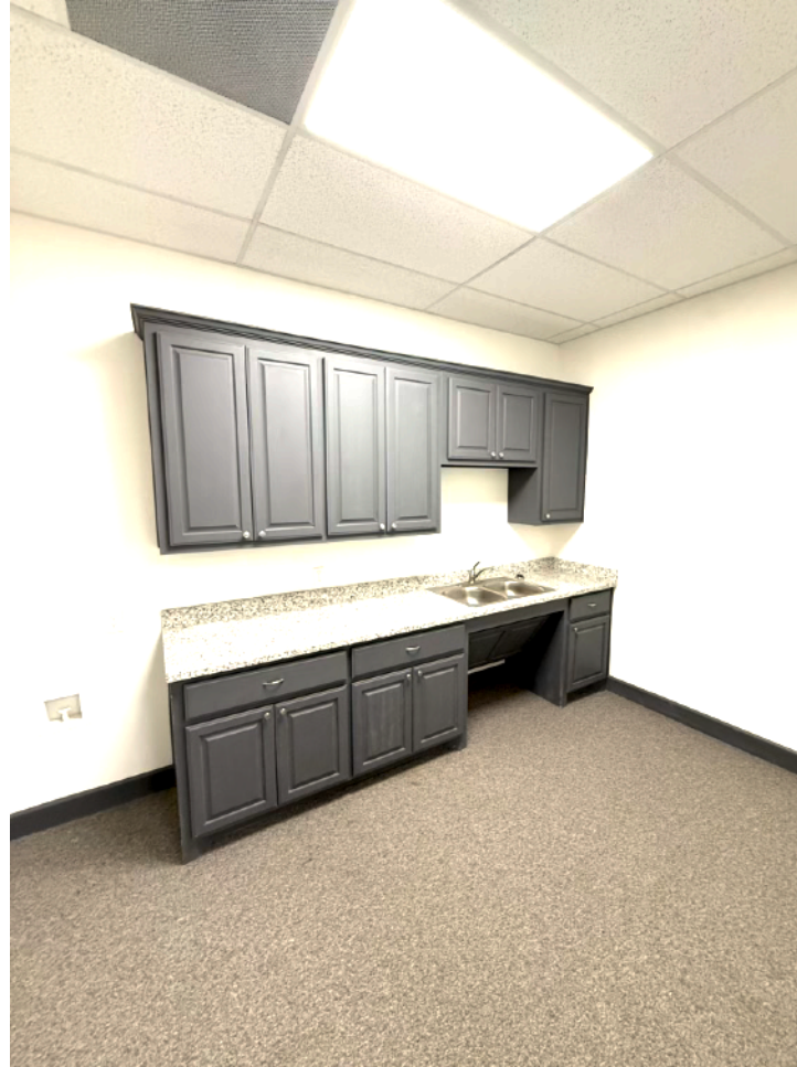
Upstairs Break Room