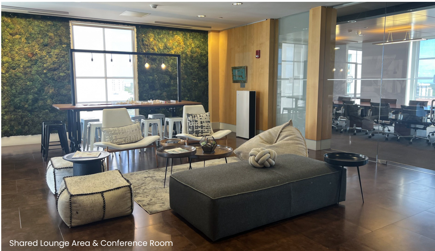
Shared Lounge Area & Conference Room