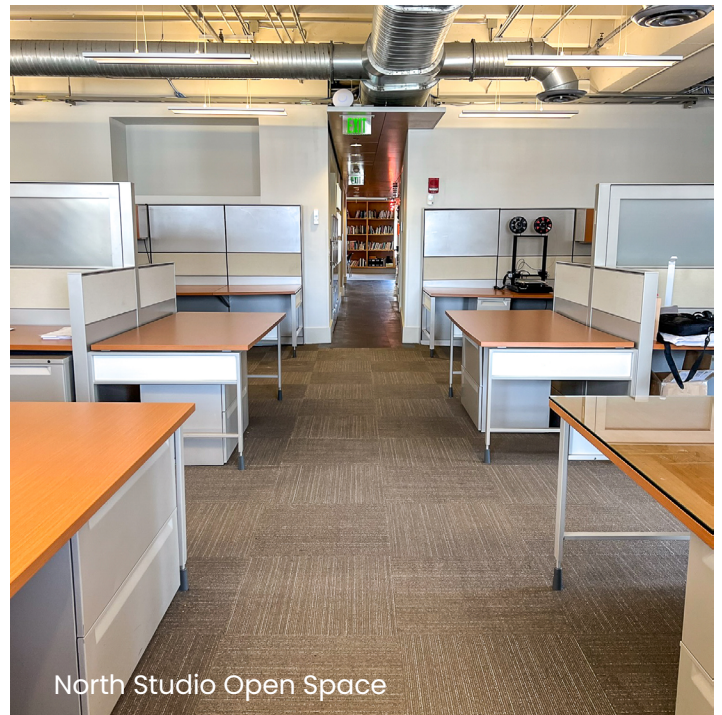
North Studio Open Space