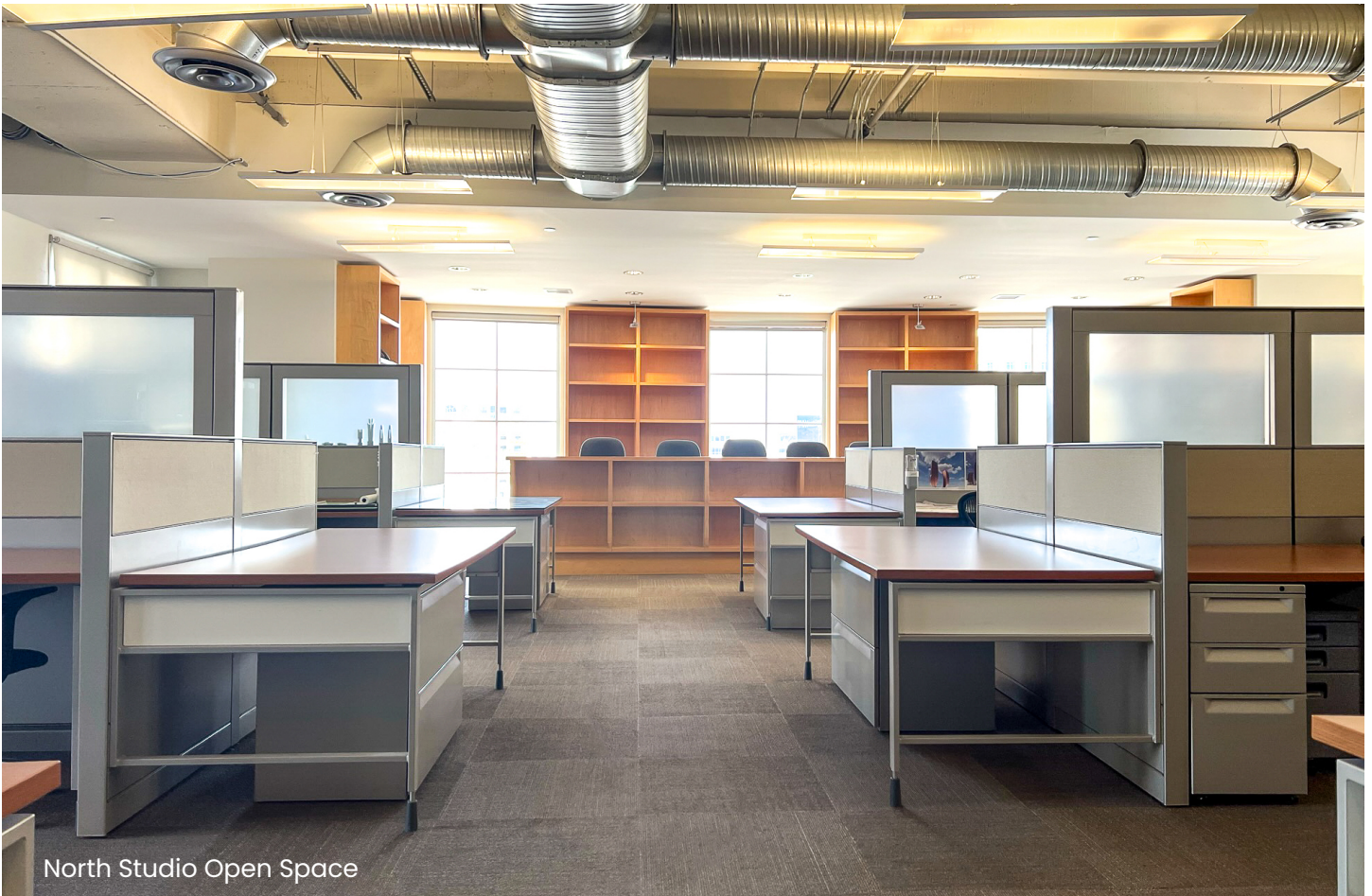
North Studio Open Space