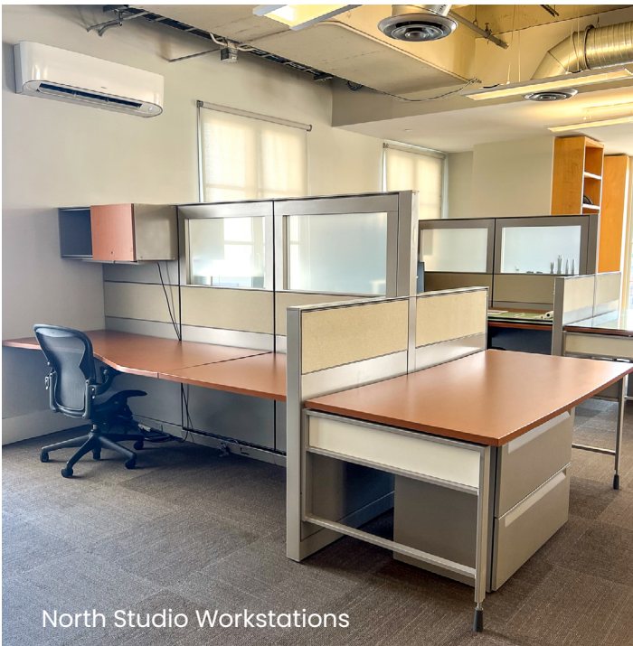
North Studio Workstations