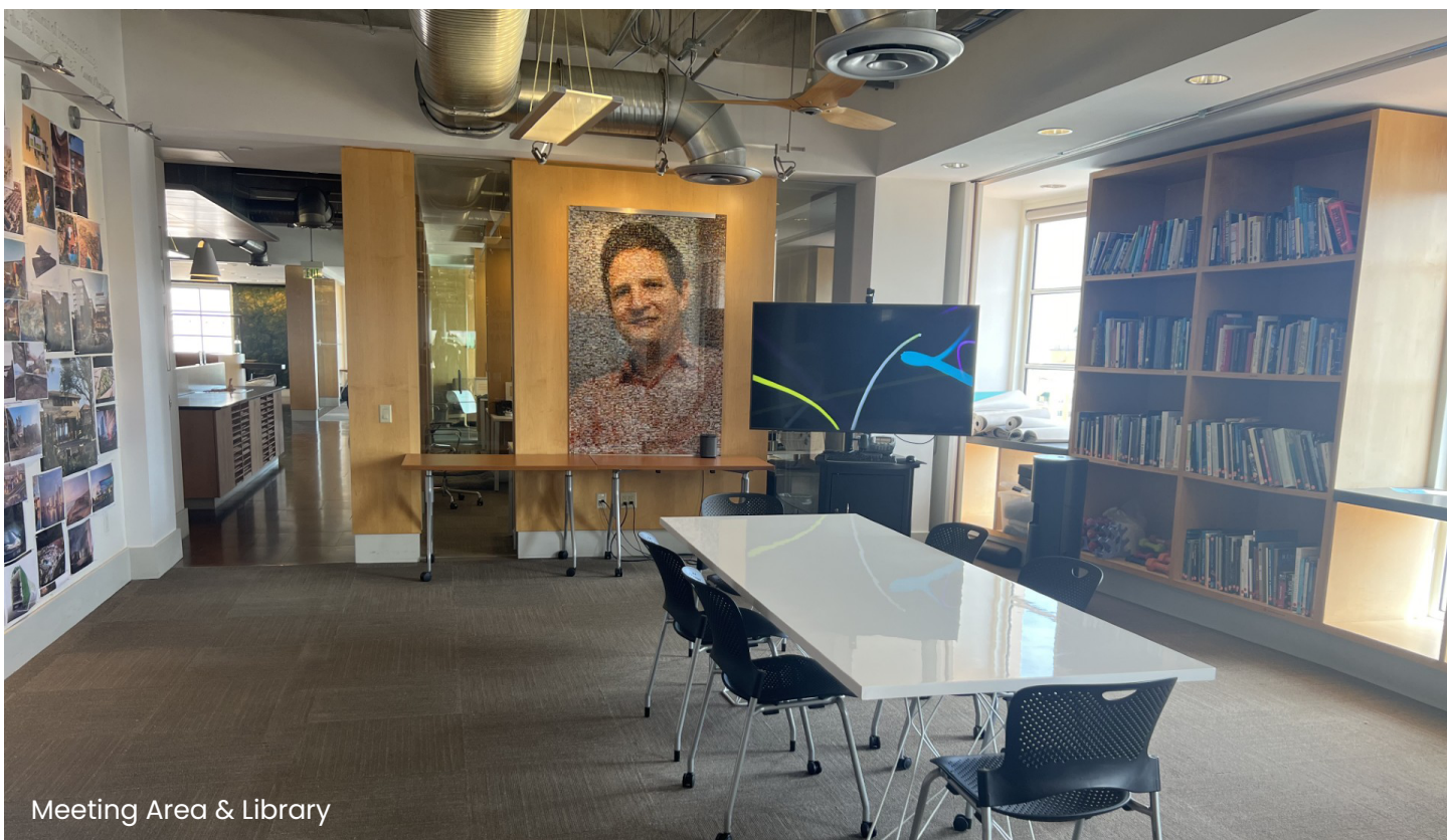
Meeting Area & Library