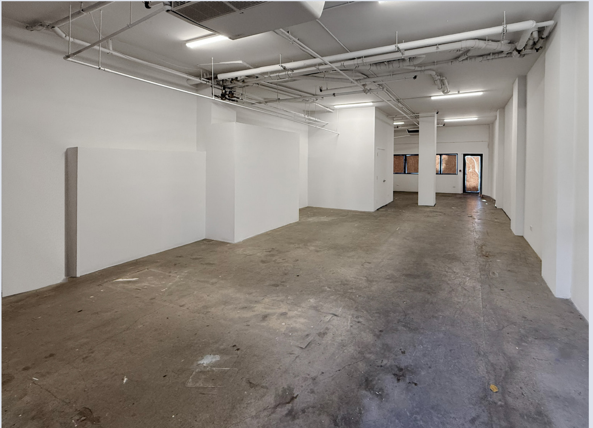
Current conditions - looking towards the rear of the space