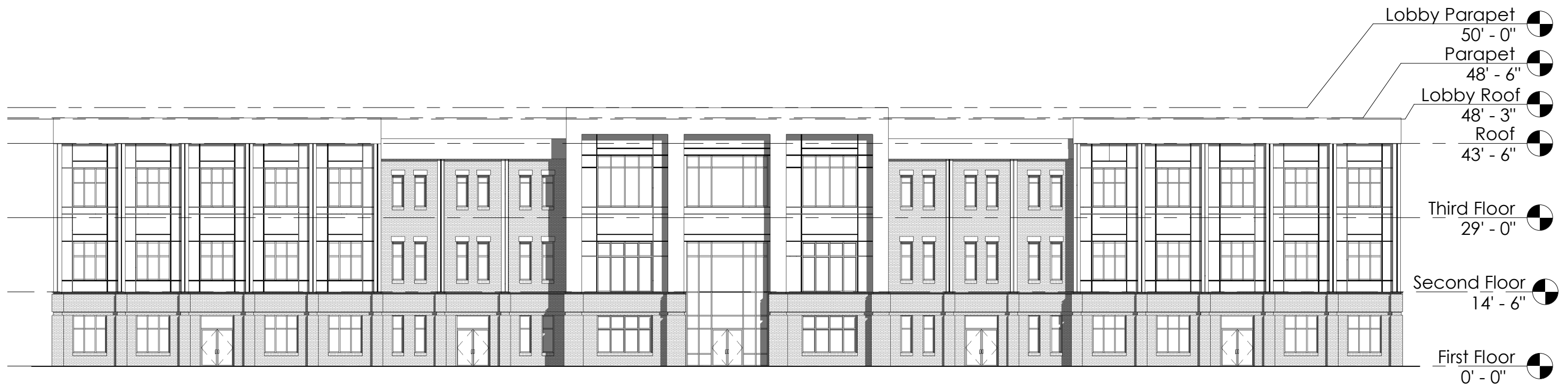
1 Existing N. Elevation