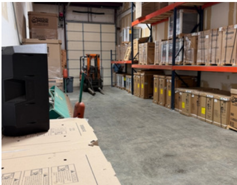
Warehouse, Drive In Door #1