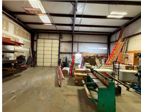
Warehouse, Drive In Door #2