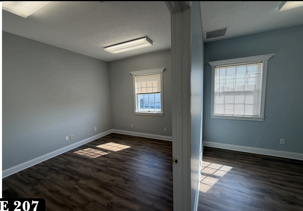
SUITE 207 327 Sq. Ft