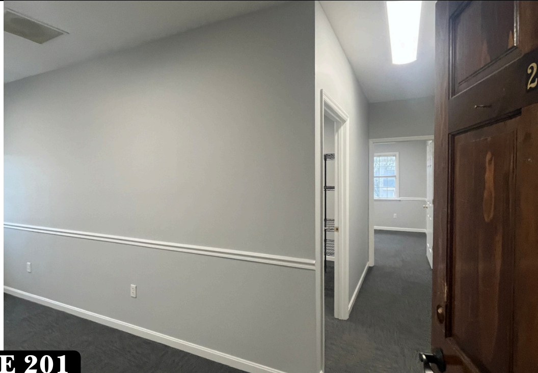
SUITE 201 621 Sq. Ft