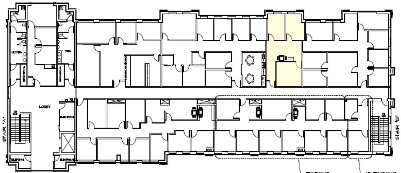
Ⓜ SECOND FLOOR TENANT DEMISING PLAN 3/32" = 1'-0" (ON 24x36 SHEET)