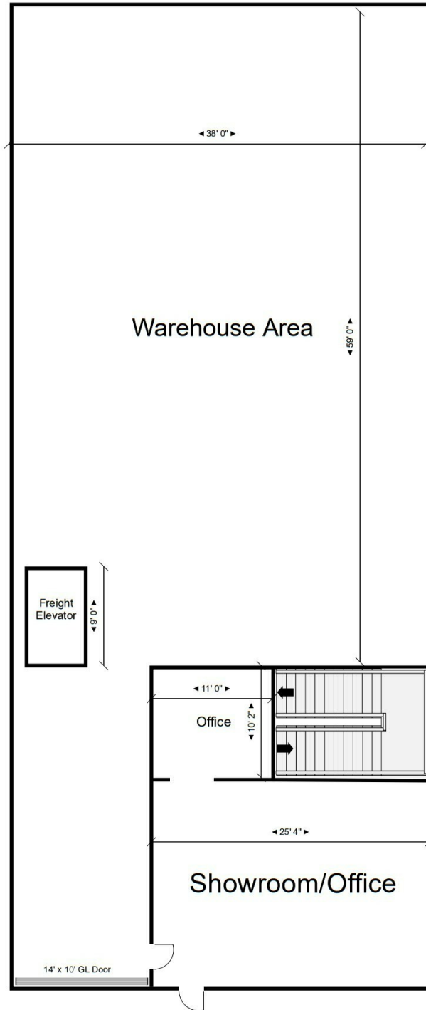
Main Level Floor Plan

CHRIS METOS ERIC FUHRMAN 801.879.7870 801.859.2862 chris@iproperties.com eric@iproperties.com