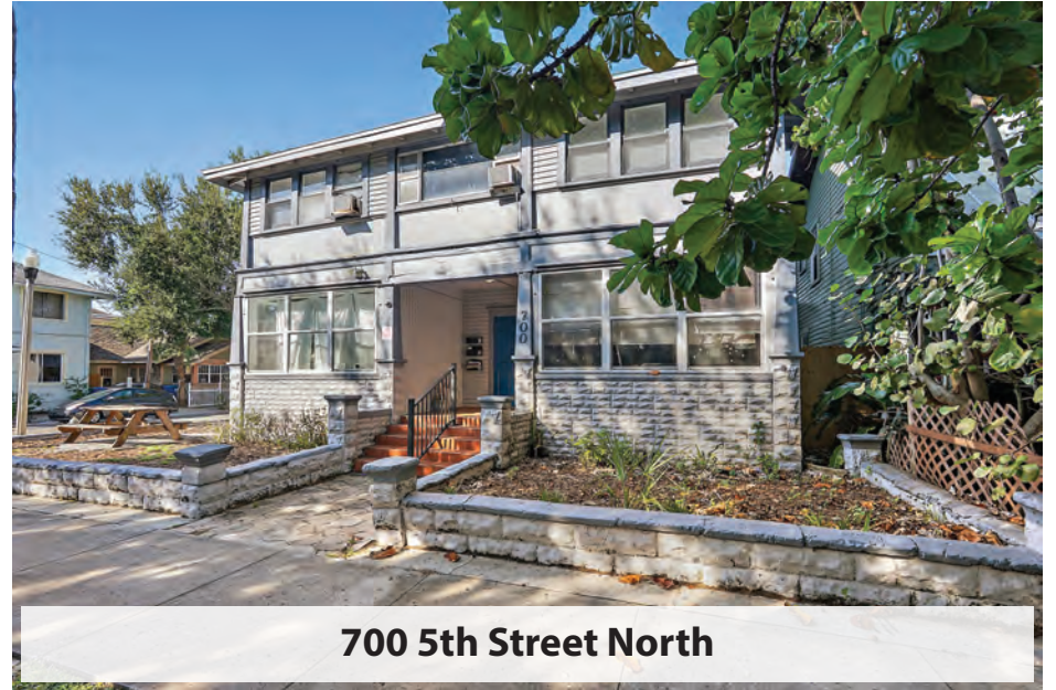
700 5th Street North