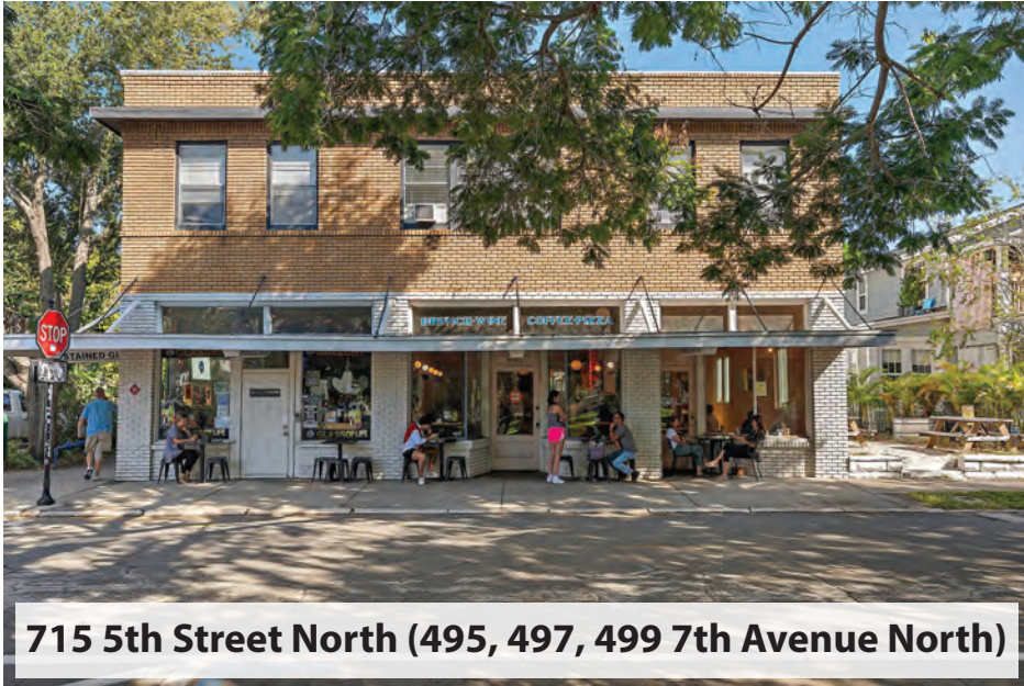
715 5th Street North (495, 497, 499 7th Avenue North)