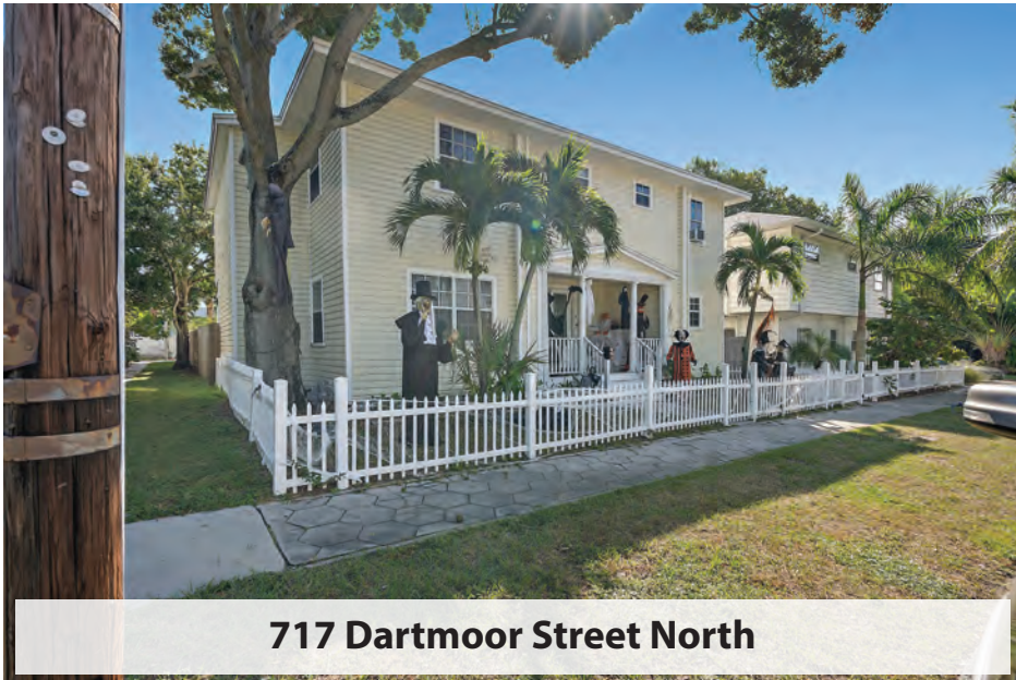
717 Dartmoor Street North