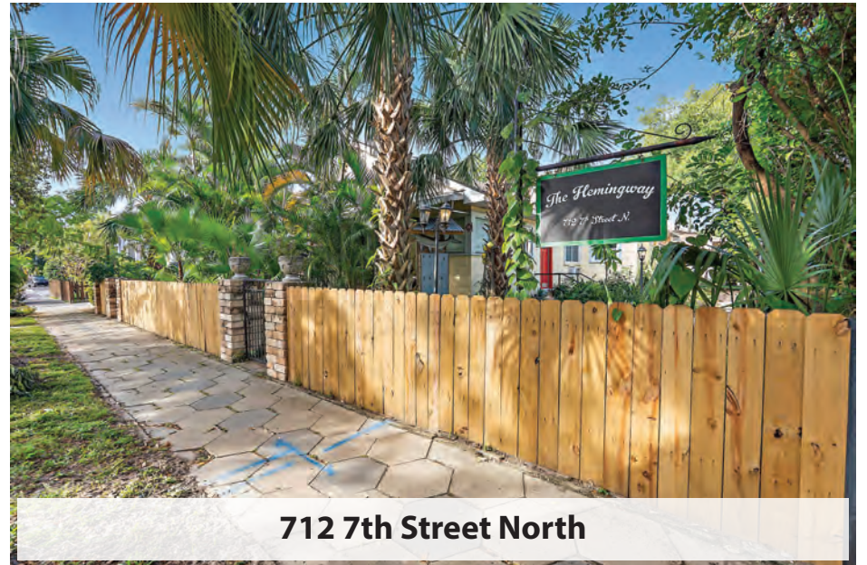
712 7th Street North