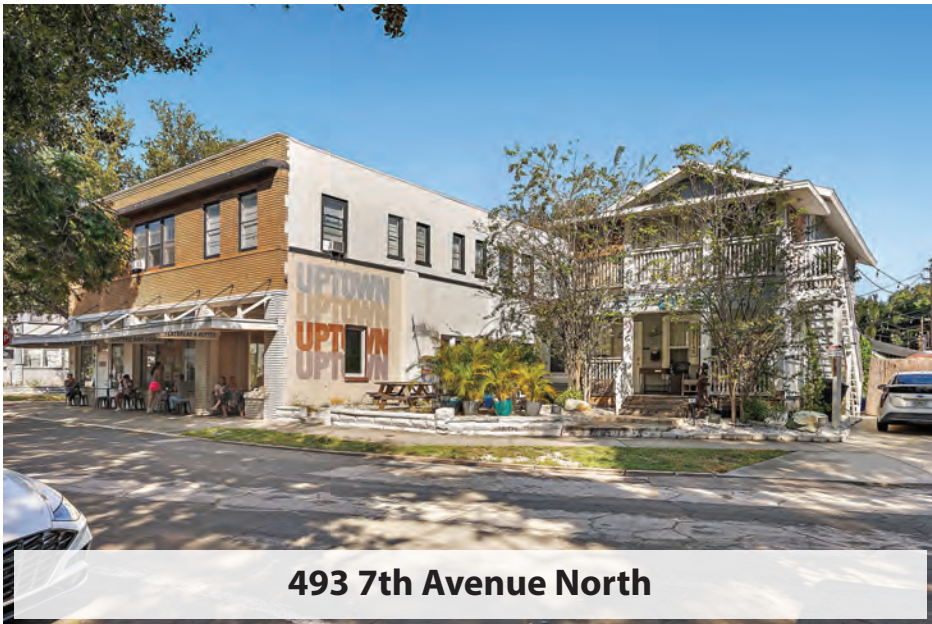
493 7th Avenue North