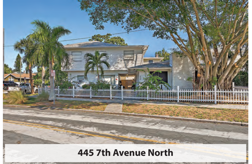
445 7th Avenue North