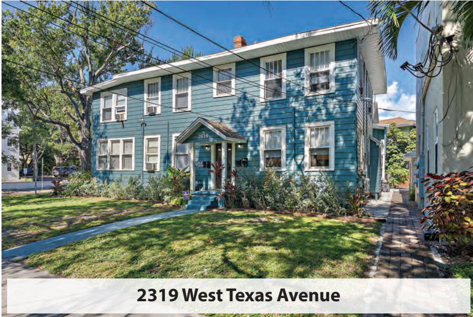
2319 West Texas Avenue