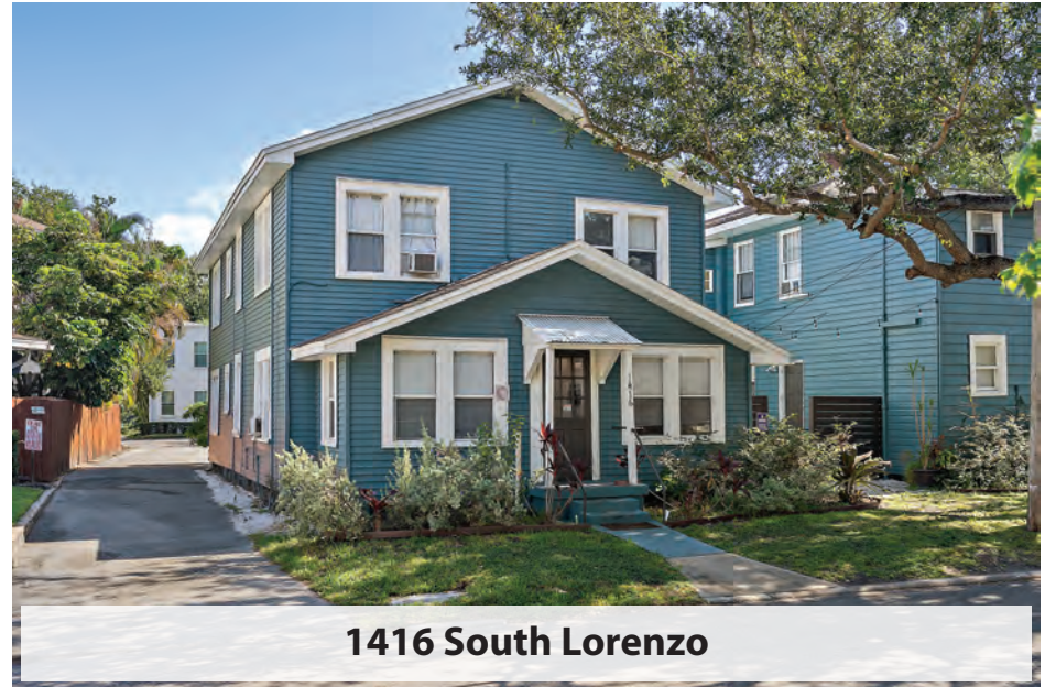
1416 South Lorenzo