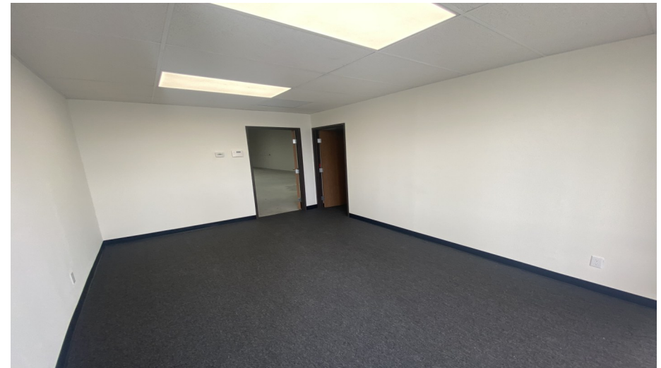
Example interior photos and may not be the exact suite for lease