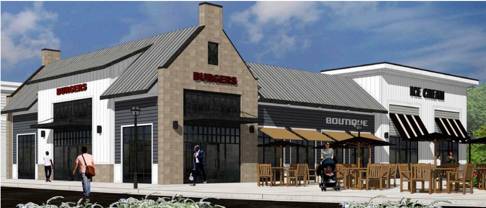
New Retail/Office Development | 500-504 Cedar Road, Chesapeake, Virginia