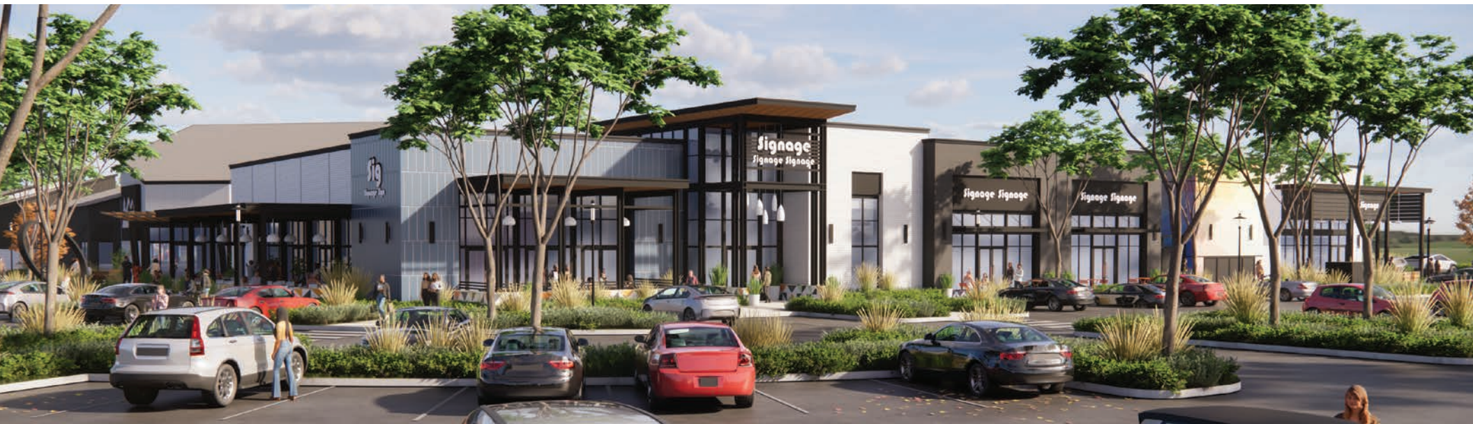
BUILDING A1 - CONCEPTUAL SOUTH ELEVATION (Signature Restaurant)