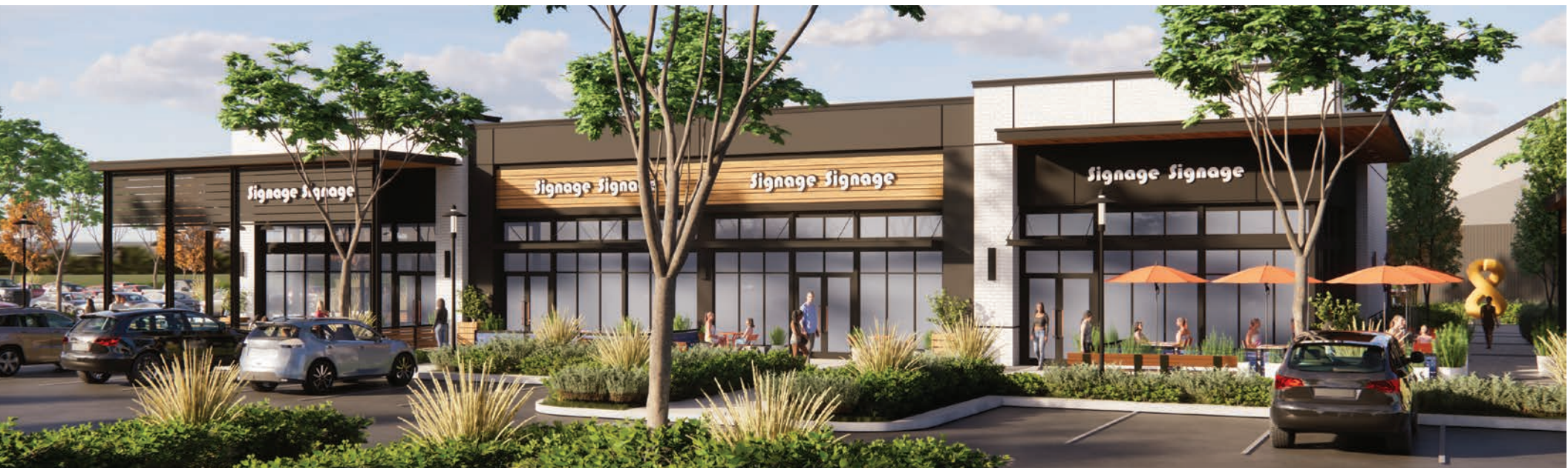
BUILDING A2 - CONCEPTUAL EAST ELEVATION (New Shops)