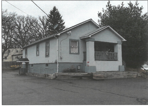
132 SOUTH LIVINGSTON AVENUE