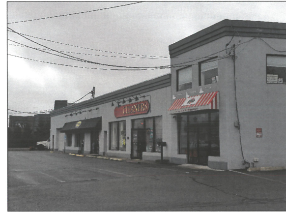
142 SOUTH LIVINGSTON AVENUE