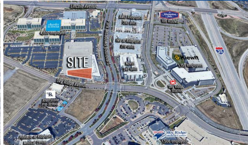
Birds Eye View Looking North