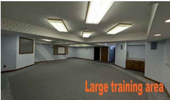
Large training area