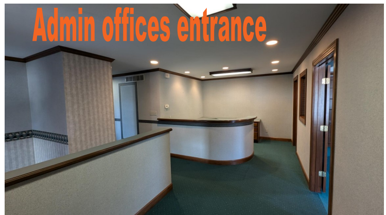
Admin offices entrance

The 1905 W. North St building's 7,500 sq.ft. is divided between 3 levels (all with separate entrances): the main level is made up of the main entrance and exam rooms, the upper level is comprised of the administrative/executive offices and the lower level being set up for group training with full audio visual capabilities and group seating for up to 30+ people.