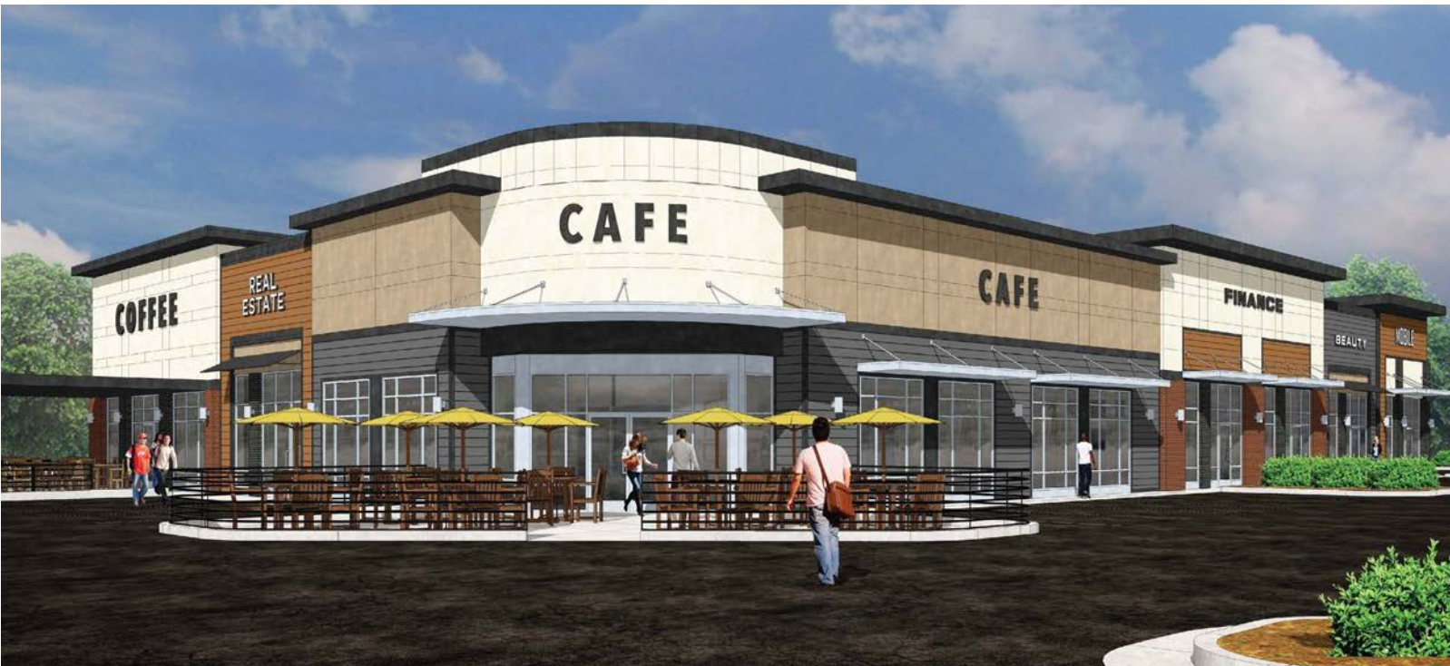
Retail Building (former Rite Aid) | 1458 Mount Pleasant Road, Chesapeake, Virginia