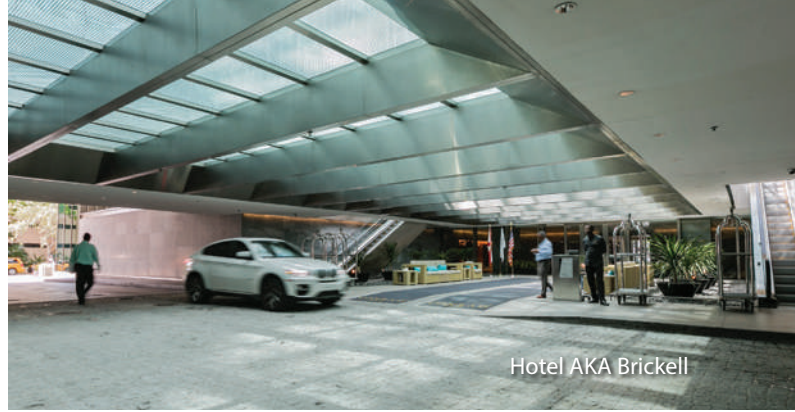
Hotel AKA Brickell