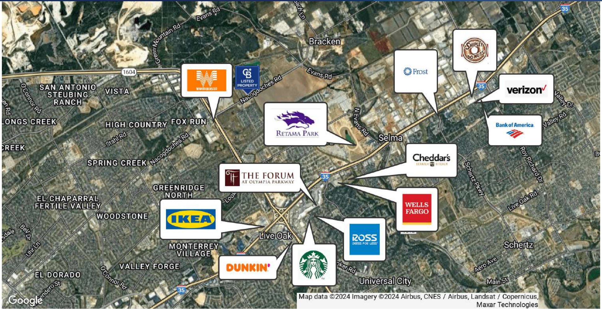
Map data ©2024 Imagery ©2024 Airbus, CNES / Airbus, Landsat / Copernicus, Maxar Technologies

17197 Nacogdoches Road San Antonio, TX 78266