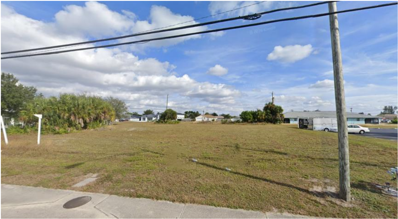
View from Del Prado Blvd N (east view)