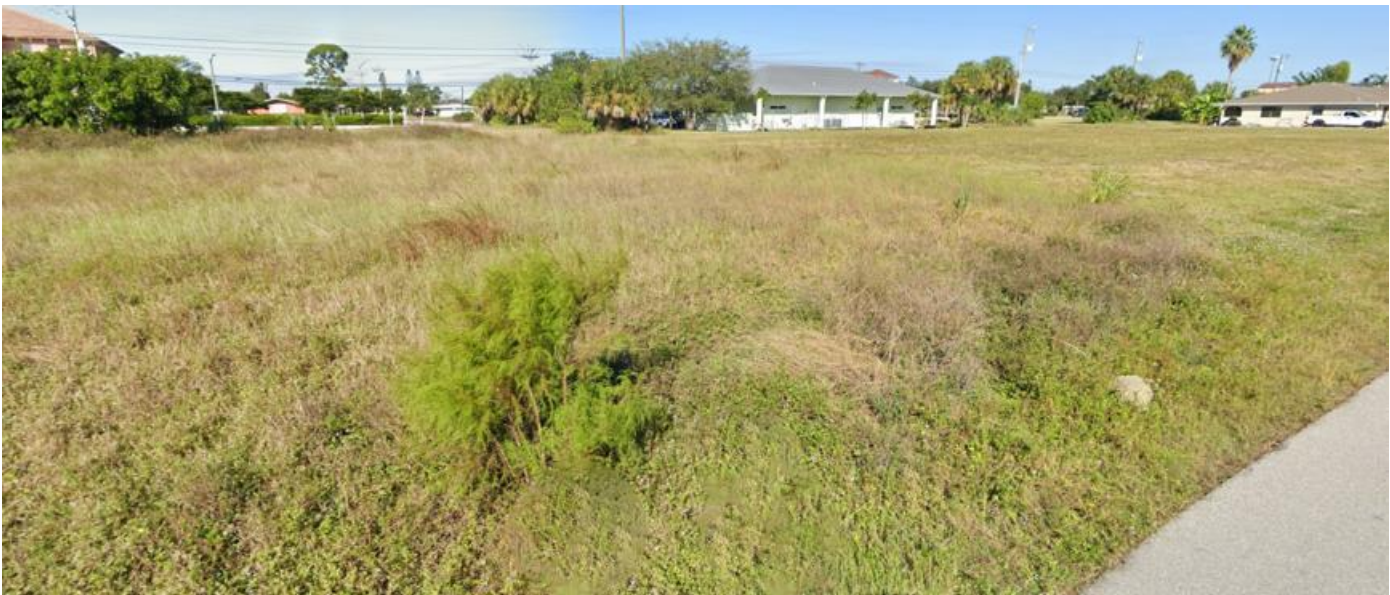
View from NE 16 th Place (west view)