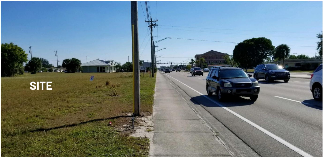
South view from Del Prado Blvd N