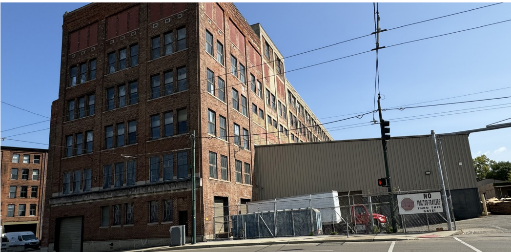
114 Wayne Avenue