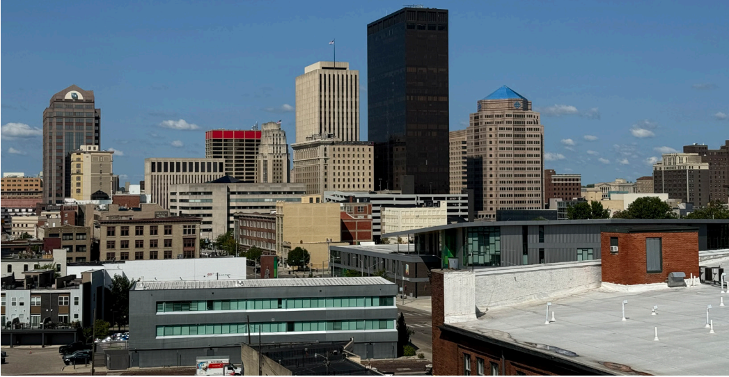
400 E. 4th Street