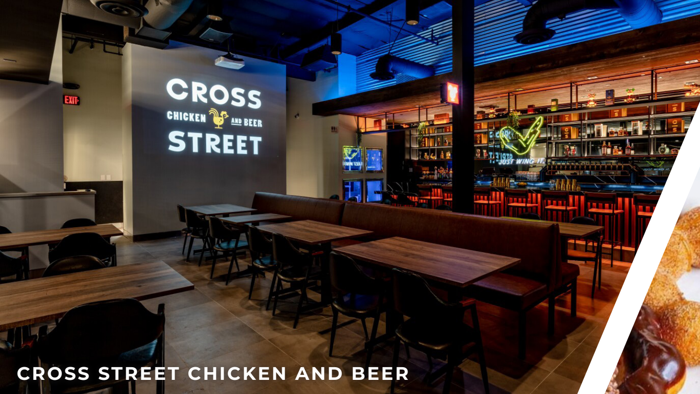
CROSS STREET CHICKEN AND BEER