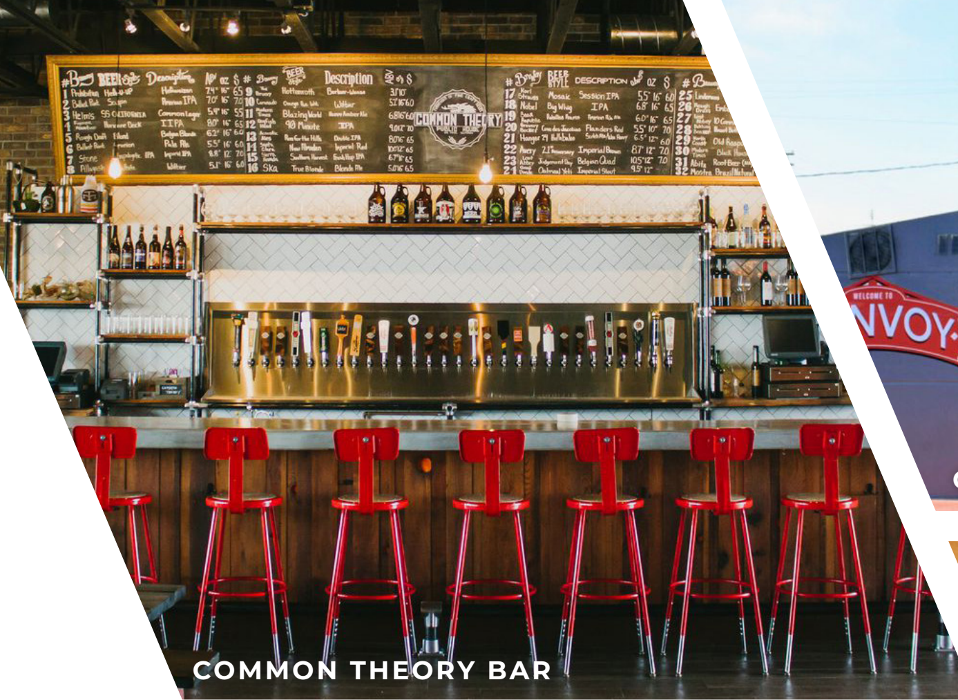
COMMON THEORY BAR

The information above has been obtained from sources believed to be reliable. While we do not doubt its accuracy, we have not verified it and make no guarantee, warranty or representation about it. It is your responsibility to independently confirm its accuracy and completeness. Any projections, opinions, assumptions or estimates used are for example only and do not represent the current or future performance of the property. The value of this transaction to you depends on tax and other factors which should be evaluated by your tax, financial and legal advisors. You and your advisors should conduct a careful, independent investigation of the property to determine to your satisfaction the suitability of the property for your needs.