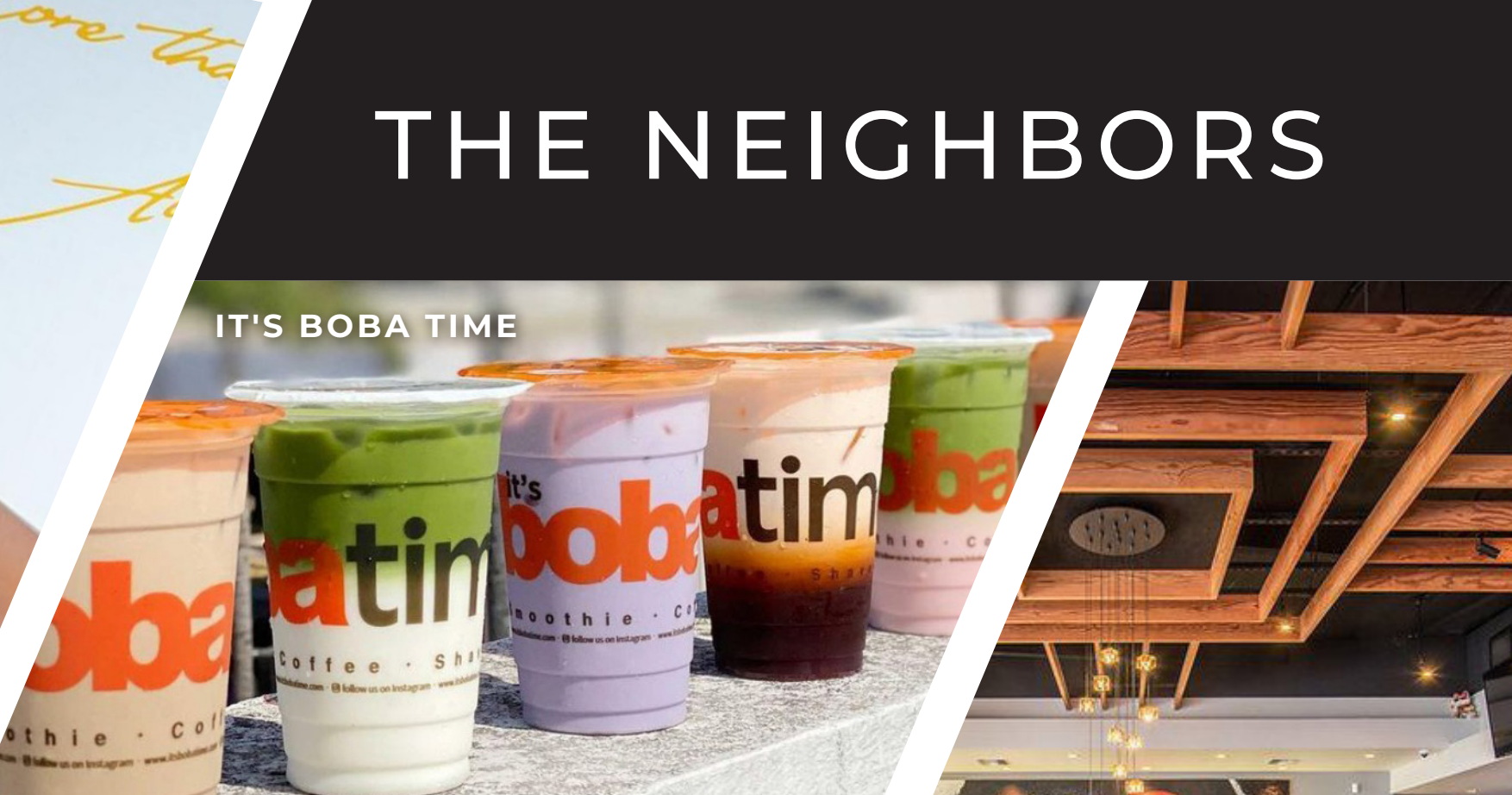
IT'S BOBA TIME