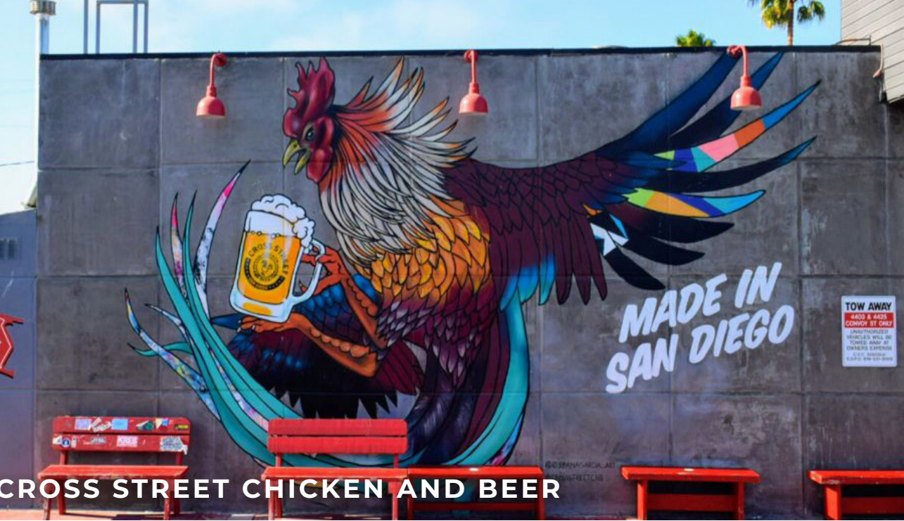
CROSS STREET CHICKEN AND BEER