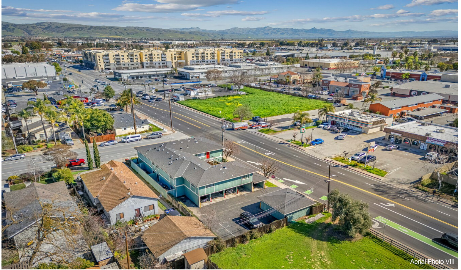
Aerial Photo VIII