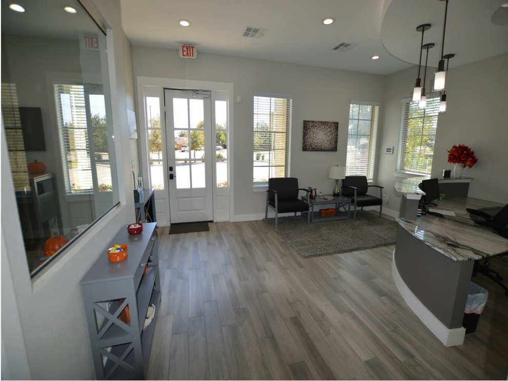
Reception - waiting area