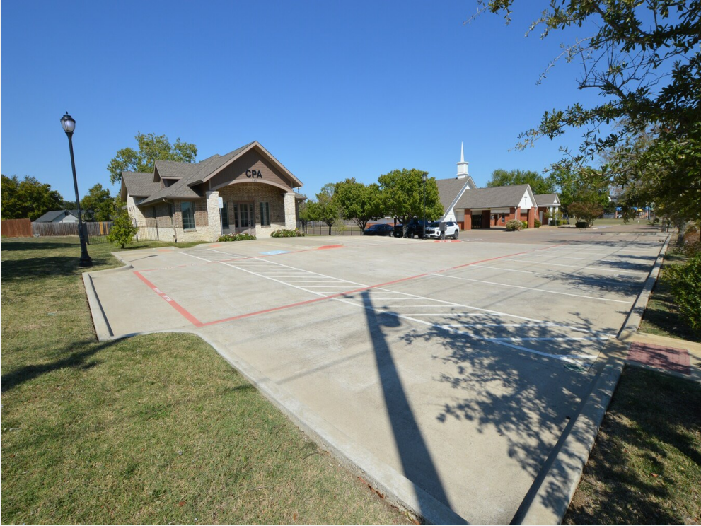
Parking in front