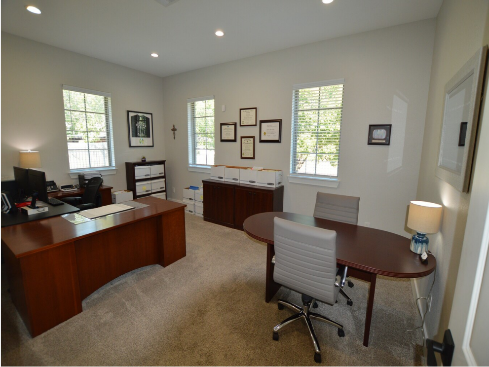
Executive office with room for side table