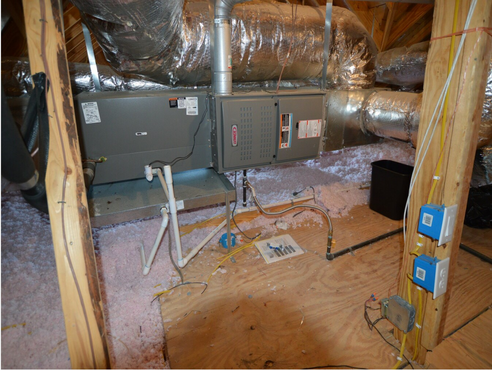
Gas heat #1