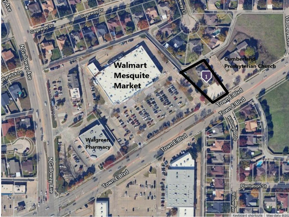
Adj. to Walmart Neighborhood & church