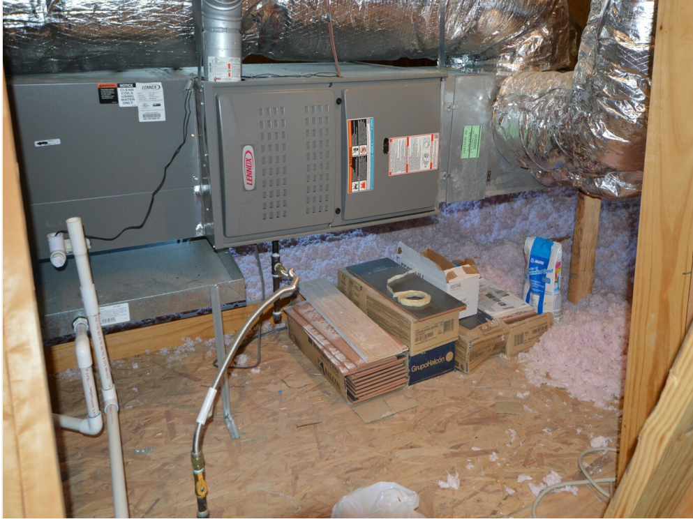
Gas heat #2