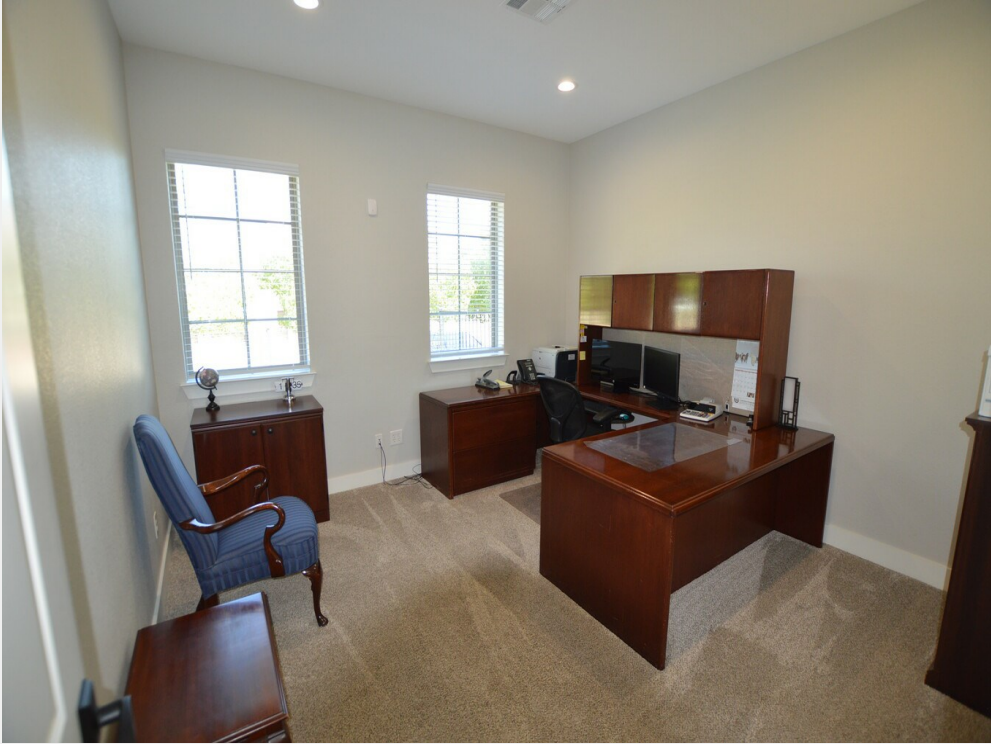
Large Executive Offices