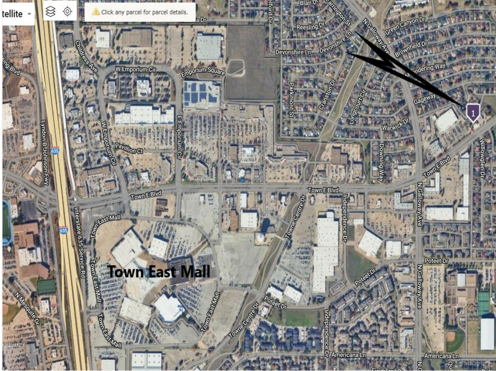
Near I-635 & Town East Mall