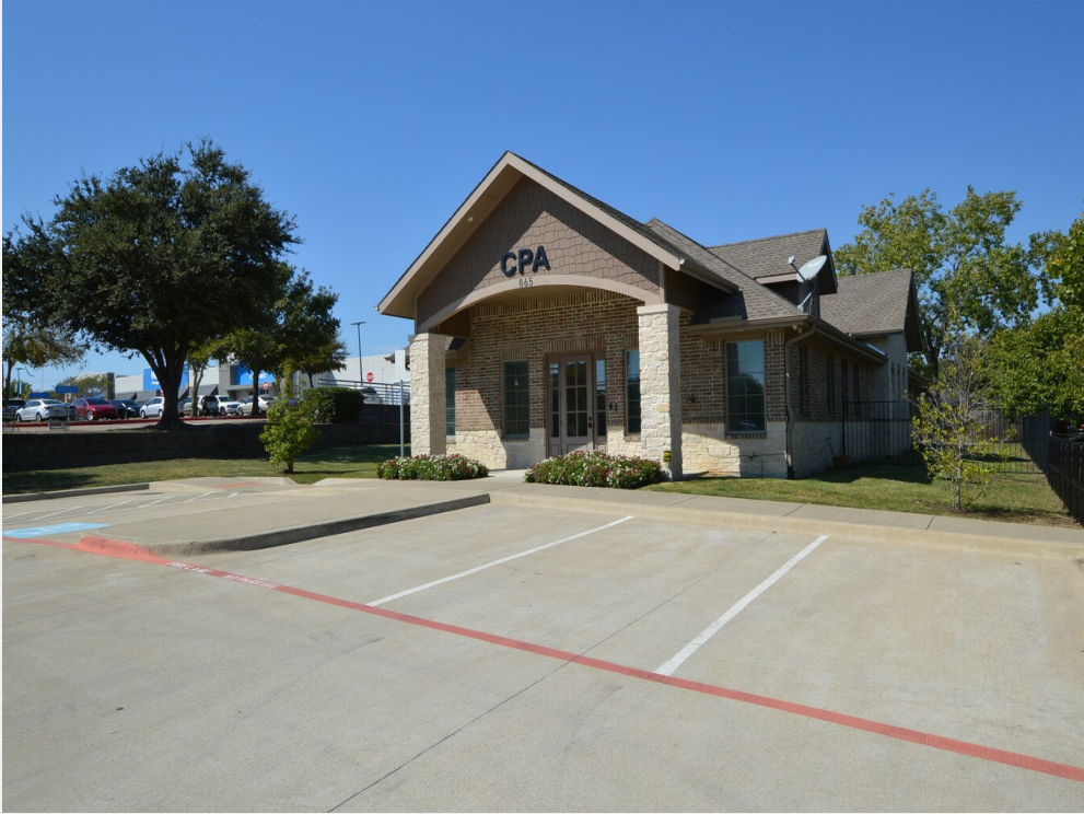
Front Elevation facing Town East Blvd