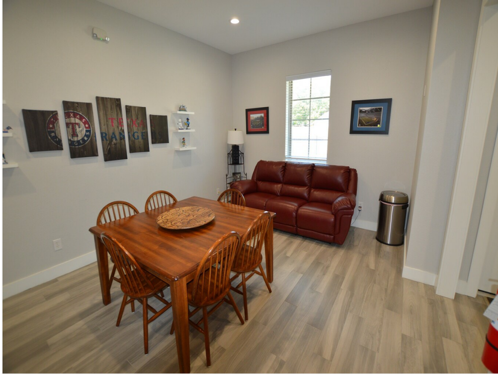
Large break room