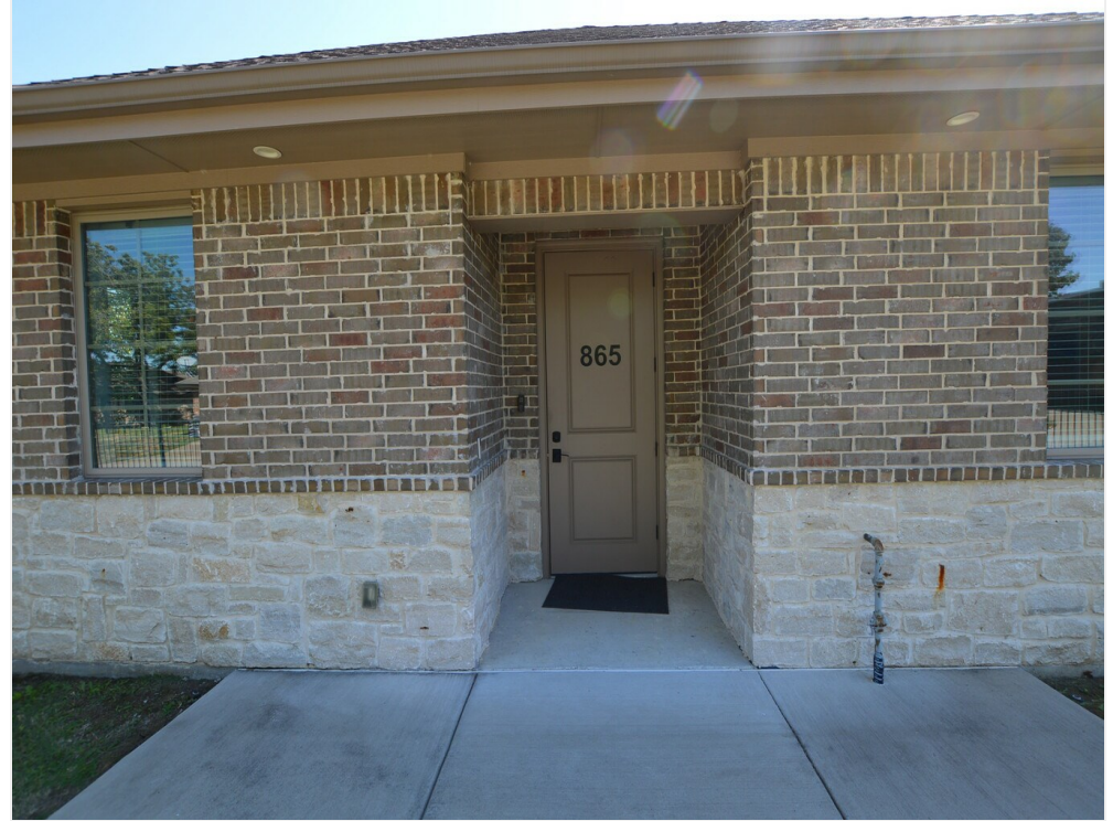
Back door to patio