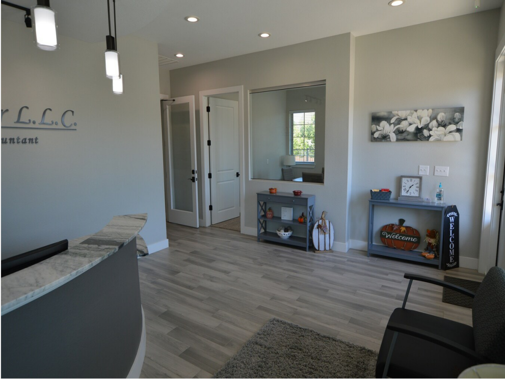
Reception - adjacent conference room