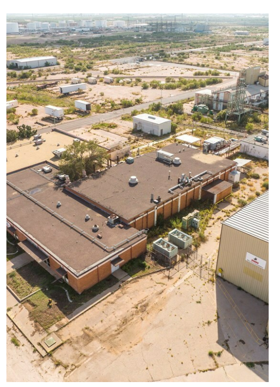
2500 S Grandview Ave