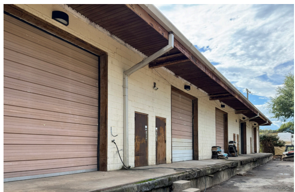
GREENVILLE COUNTY TAX MAP NO. 0151001301500