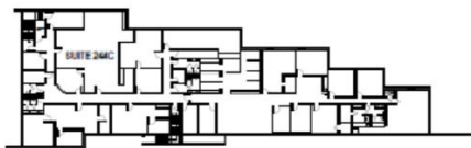
SUITE 244C SECOND FLOOR (9,947 S.F.) NOT TO SCALE