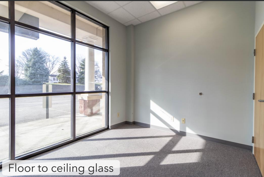
Floor to ceiling glass