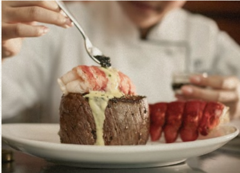
FLEMING'S PRIME STEAKHOUSE & WINE BAR