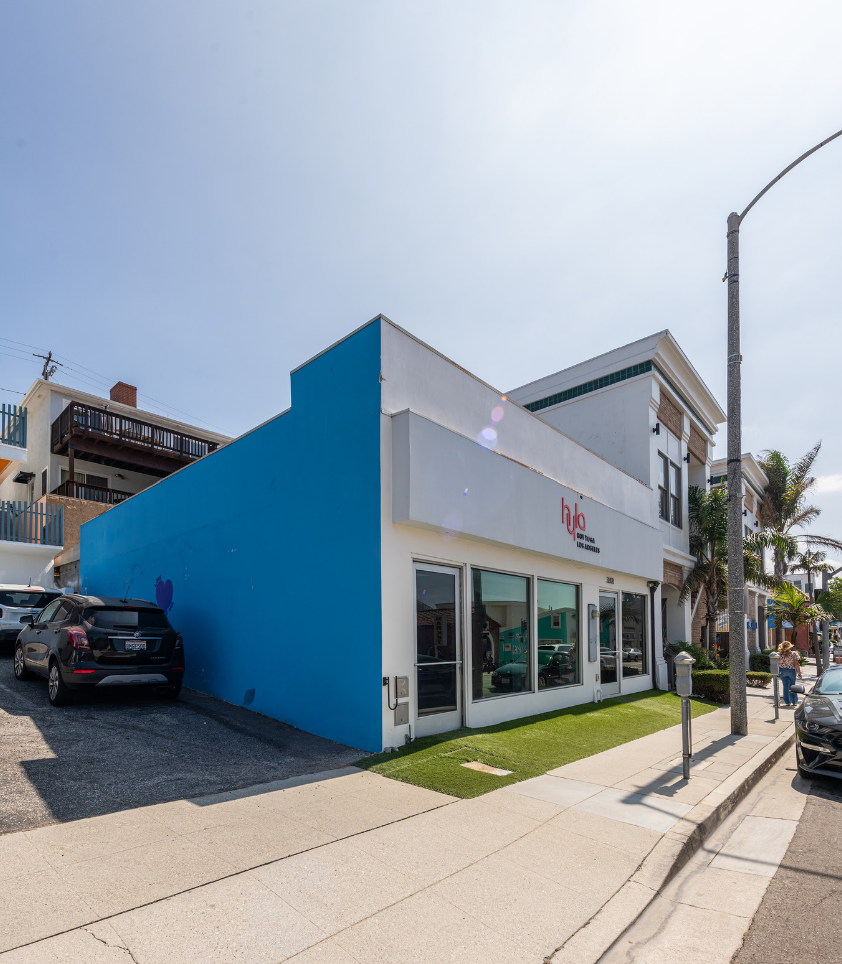
3308 HIGHLAND AVE, MANHATTAN BEACH