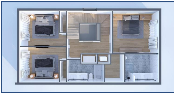
Floorplan – 3 rd Floor