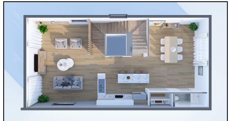
Floorplan – 2 nd Floor

Ray Alexander Mobile 941-704-2168 ray@seasalt-properties.com 13750 Park Boulevard Seminole, FL 33776