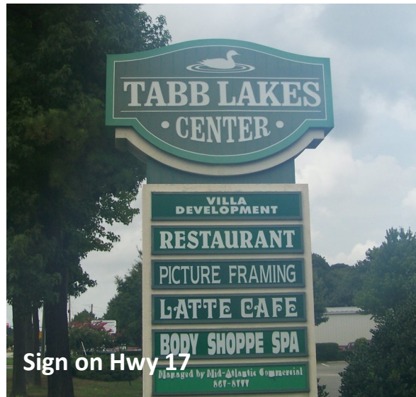
Sign on Hwy 17