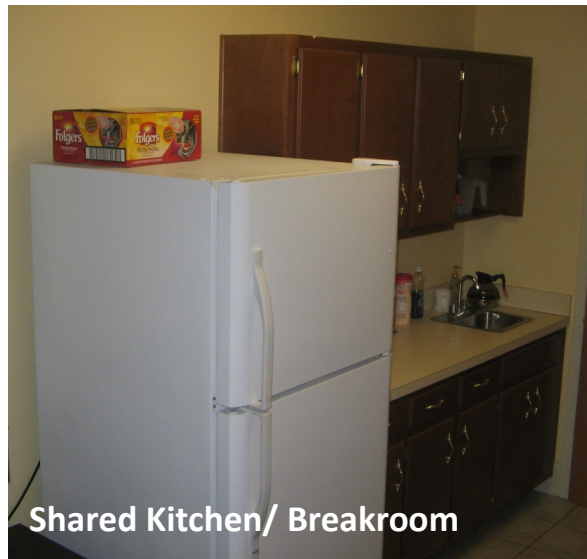
Shared Kitchen/ Breakroom