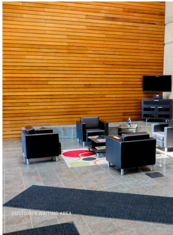
CUSTOMER WAITING AREA