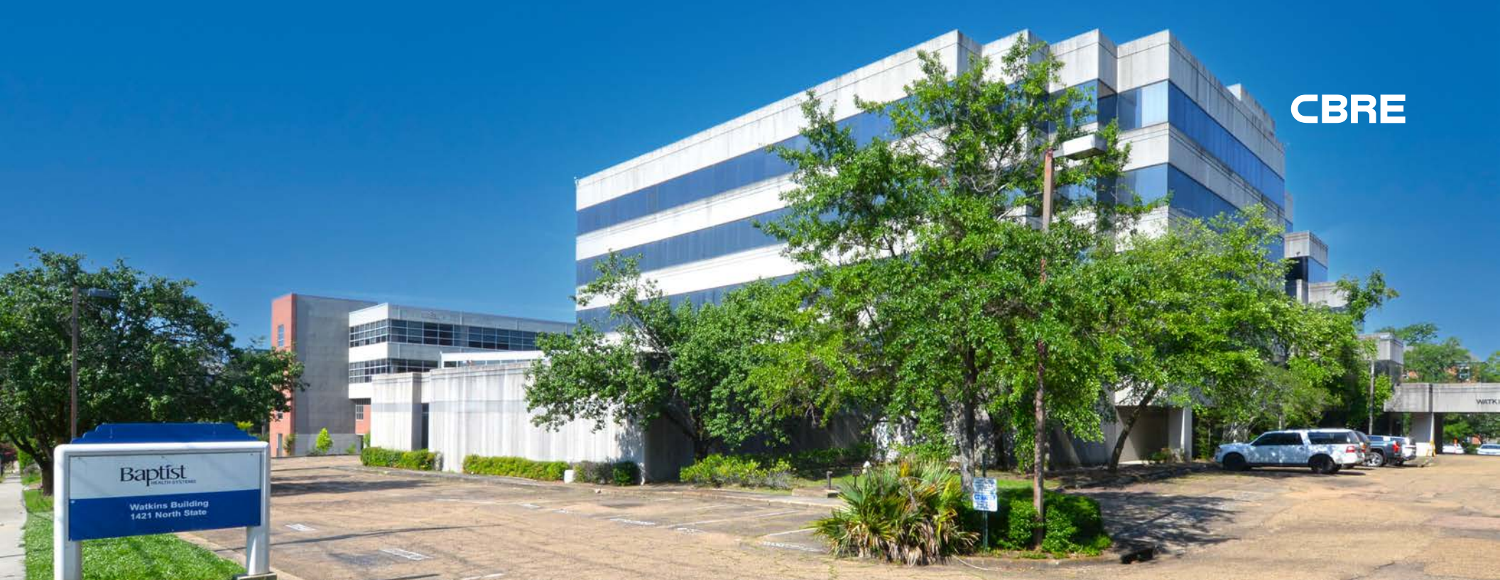
1421 N STATE STREET, JACKSON, MS 39202 | THE WATKINS BUILDING