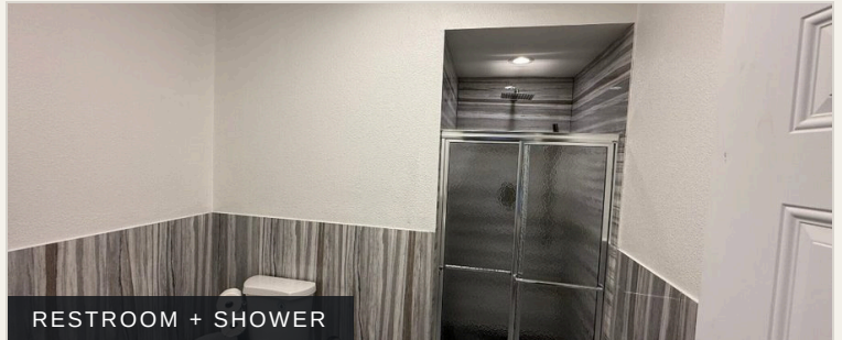
RESTROOM + SHOWER