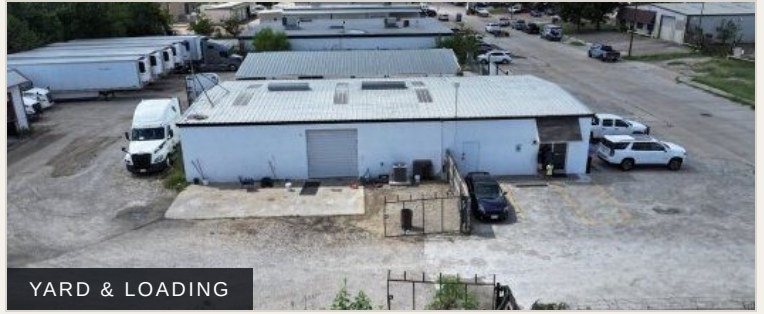
YARD & LOADING