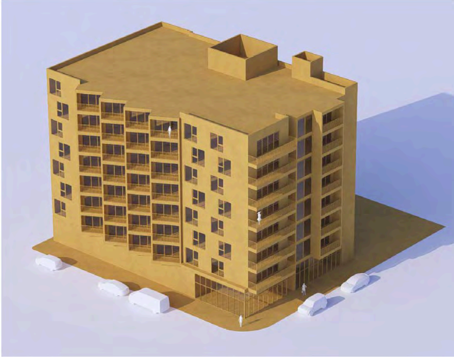
VIEW FROM SOUTHWEST