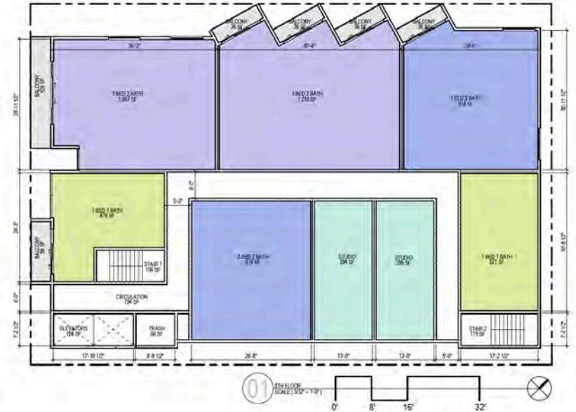
FLOOR 8: BUILDING PLAN