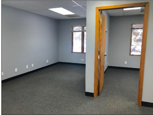
Example of office suite

1263 S. Highland Ave, Suite 2W Lombard, IL 60148 Office: 630.932.5757 Fax: 630.932.5755 www.key-investment.com Kimberly Hess khess@key-investment.com