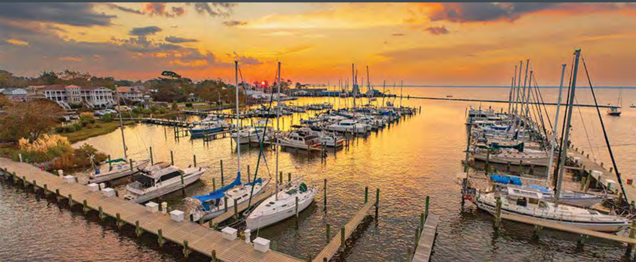
Sunset at the harbor of Oriental, "The Sailing Capital of NC"