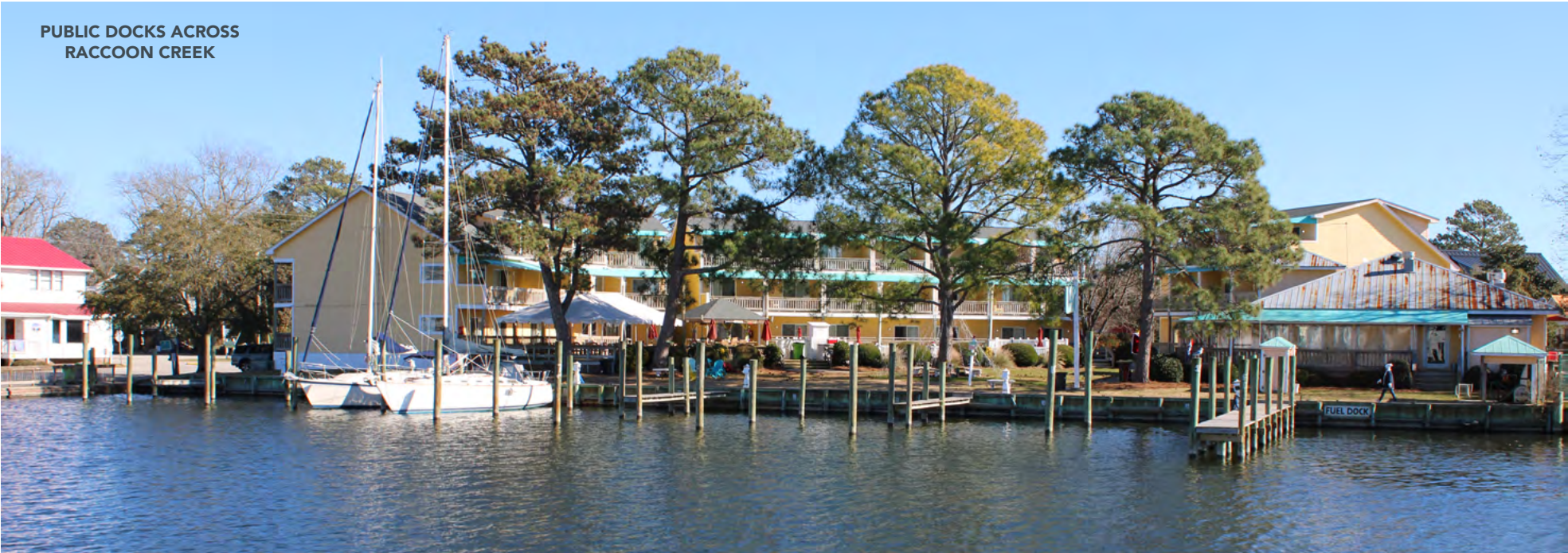
PUBLIC DOCKS ACROSS RACCOON CREEK