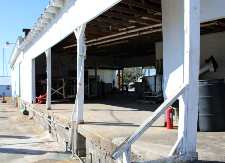
FULCHERS SEAFOOD | 301 HODGES STREET ORIENTAL, NC 28571