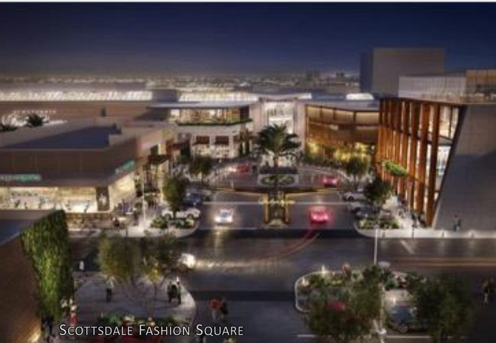
SCOTTSDALE FASHION SQUARE