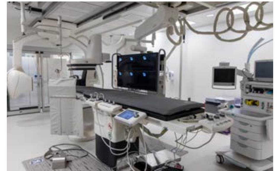
STATE-OF-THE-ART OPERATING ROOMS