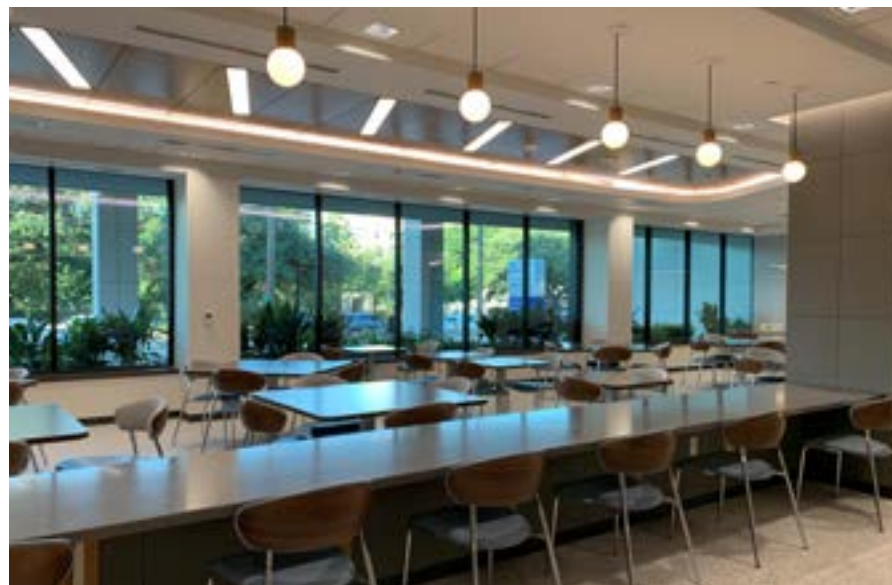
UPSCALE CAFE SEATING