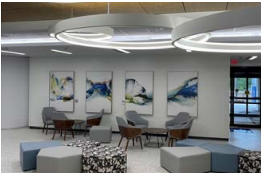
NEWLY RENOVATED LOBBY