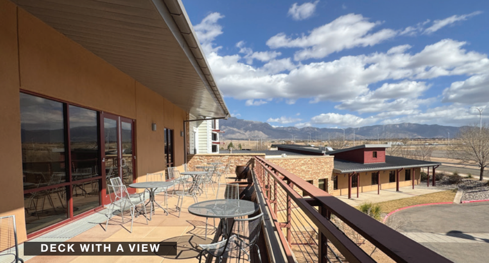
DECK WITH A VIEW

This Class-A office building is located on the northern edge of Albuquerque near Balloon Fiesta Park. The mountain views from any one of the six patios and decks are spectacular. The property also features 50 covered parking spaces.