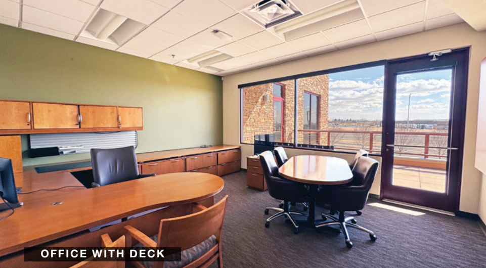
OFFICE WITH DECK

Productivity won't be a problem with highly-refined work areas consisting of 37 offices and open work spaces with lots of natural light. There is also a large climate-controlled storage area and a two-car garage.