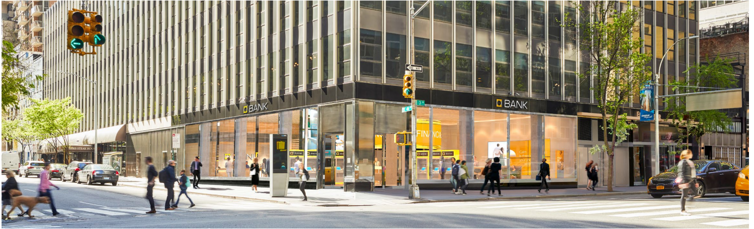
4,006 SF GROUND FLOOR CORNER RETAIL OPPORTUNITY