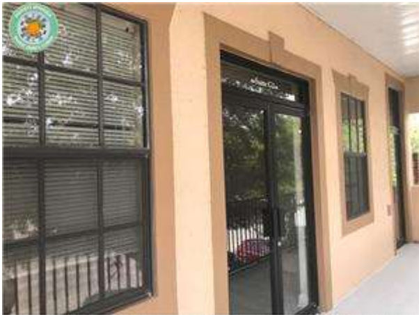
301 S TUBB ST UNIT G2, OAKLAND, FL 34760 5/31/2023 3:45 PM