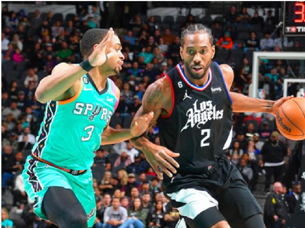
SAN ANTONIO SPURS