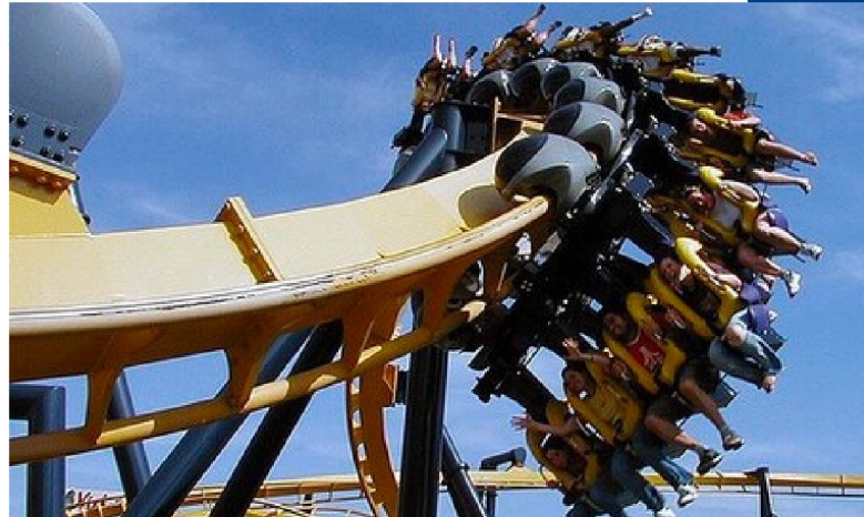
SIX FLAGS OVER TEXAS FIESTA TEXAS