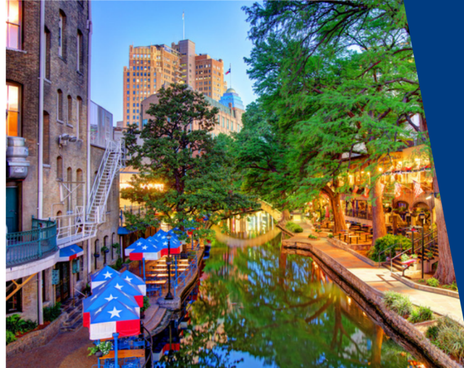
SAN ANTONIO RIVERWALK