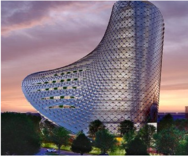
TECH PORT CENTER & ARENA