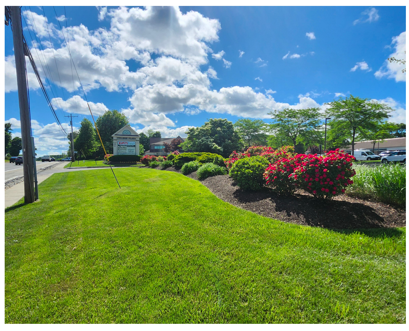
College Plaza Shopping Center Beautifully Manicured Landscape