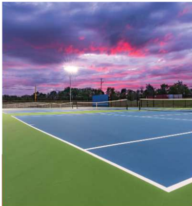
Snowden Grove Tennis Center 1 MILE FROM TOP OF THE SIPP

7 outdoor full sized soccer fields, with lighting for nighttime play