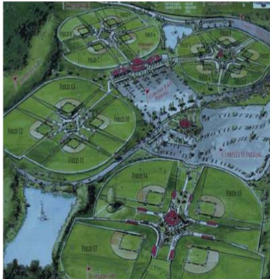
Snowden Grove Park 0.5 MILES FROM TOP OF THE SIPP

The BankPlus Amphitheater is one of the most popular outdoor entertainment venues in the Mid-South. With recent 10-million-dollar renovations, this 7 acre, 125,000 square foot treasure has expanded to just under 10,000 permanent seats, with new premium box seating and VIP lounge.