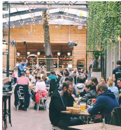
Silo Square 0.6 MILES FROM TOP OF THE SIPP

12 lighted outdoor tennis courts with pavilion and covered seating