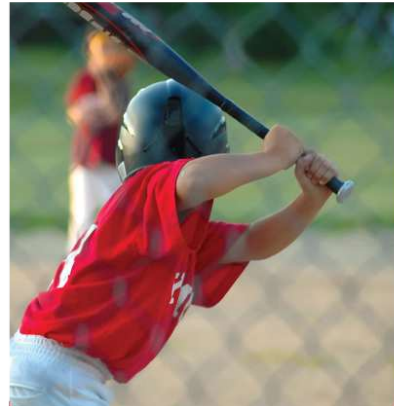
BankPlus Sports Center 0.4 MILES FROM TOP OF THE SIPP

One of the premier youth baseball facilities in the United States, housing 17 turf baseball fields with state-of-the-art features previously only found at professional stadiums. Hosts numerous baseball tournaments including youth world series events.