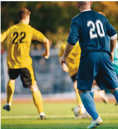
Snowden Grove Soccer Center 0.25 MILES FROM TOP OF THE SIPP

This indoor sports complex attracts all ages in the community. Home to soccer fields, baseball and softball practice facilities, batting cages and batting tunnels, a sports shop, and two outdoor 18-hole miniature golf courses.