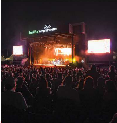
BankPlus Amphitheater 0.5 MILES FROM TOP OF THE SIPP

The BankPlus Amphitheater is one of the most popular outdoor entertainment venues in the Mid-South. With recent 10-million-dollar renovations, this 7 acre, 125,000 square foot treasure has expanded to just under 10,000 permanent seats, with new premium box seating and VIP lounge.