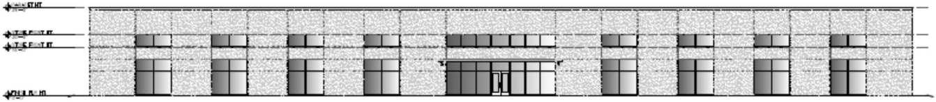
1 FRONT ELEVATION SCALE 3/32" = 1'-0"